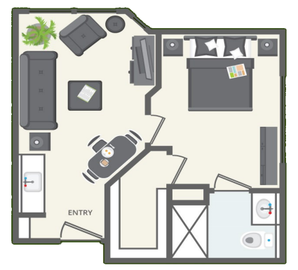
1 & 2 Bedroom Units

1 Bedroom - $1995 - $2195* - 450 - 700 sq. ft.